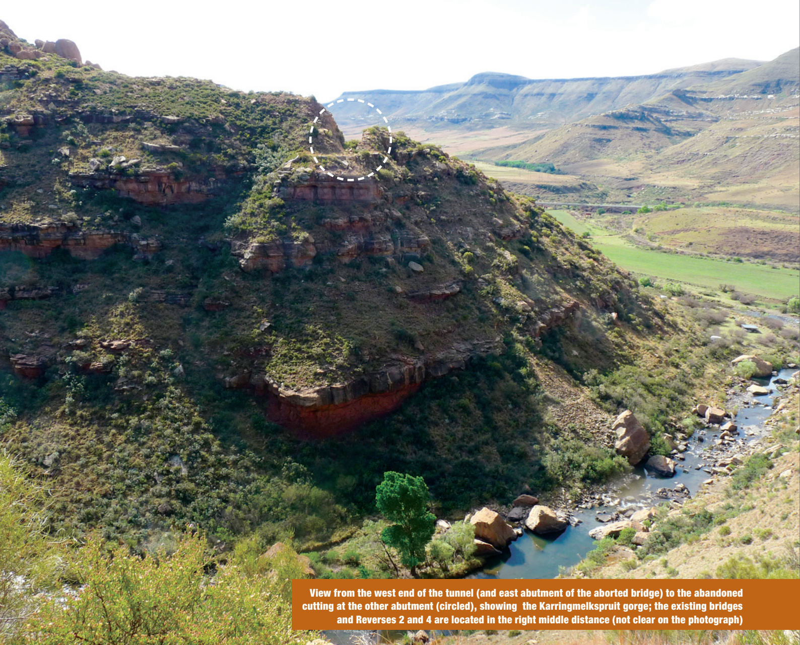
View from the west end of the tunnel (and east abutment of the aborted bridge) to the abandoned cutting at the other abutment (circled), showing the Karringmelkspruit gorge; the existing bridges and Reverses 2 and 4 are located in the right middle distance (not clear on the photograph)