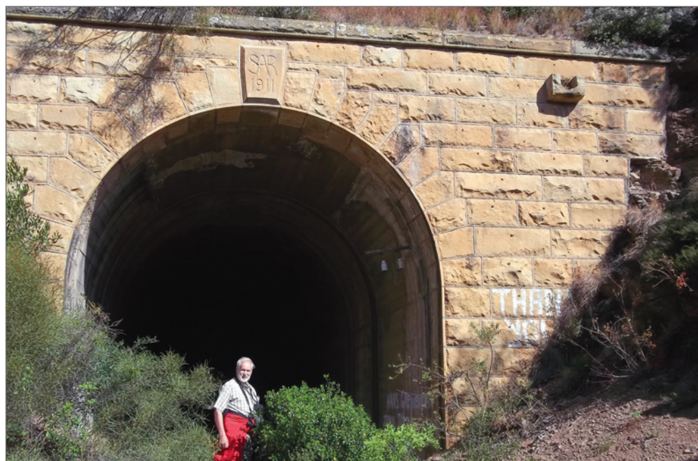
Concrete-lined over its entire 70 m, both portals of the abandoned rail tunnel incorporate one “SAR 1911” keystone; fine sandstone masonry is typical of the area