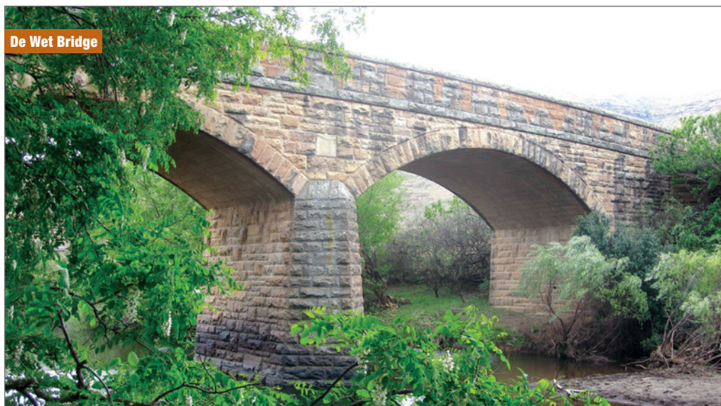
De Wet Bridge

These two beautiful sandstone bridges, both designated national monuments, are in close proximity of the railway line – completed in 1899, the De Wet Bridge crosses the Karringmelkspruit near Reverse 4 about 11 km southeast of Lady Grey, while the Loch Bridge (officially named the John Laing Bridge, for the Commissioner of the Cape Department of Public Works), completed in 1893, crosses the Kraai River near Reverse 8 about 8 km northwest of Barkly East