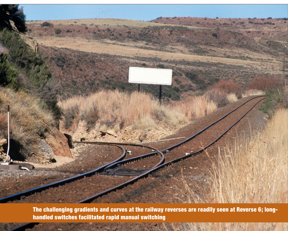
The challenging gradients and curves at the railway reverses are readily seen at Reverse 6; long-handled switches facilitated rapid manual switching

was absorbed into the South African Railways (SAR) upon unification.