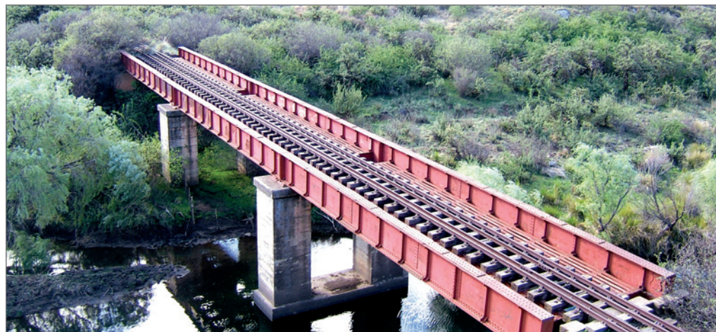
Manufactured by Westwood Baillie & Co in London in 1884, the three 40 feet (12.2 m) deck sections of the Karringmelkspruit rail bridge first served near Prieska before being moved to their present location in 1912/13