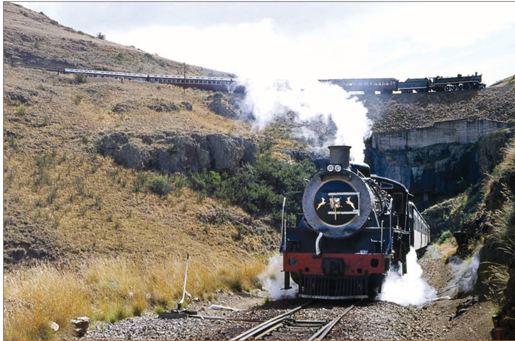
Railway reverses limit the length of trains; here a Class 19 has tightly backed up its coaches at Reverse 8, only a few metres beyond the switch, while another approaches Reverse 7

Substitution of the six reverses to replace the bridge was approved only in November 1911, three months after the